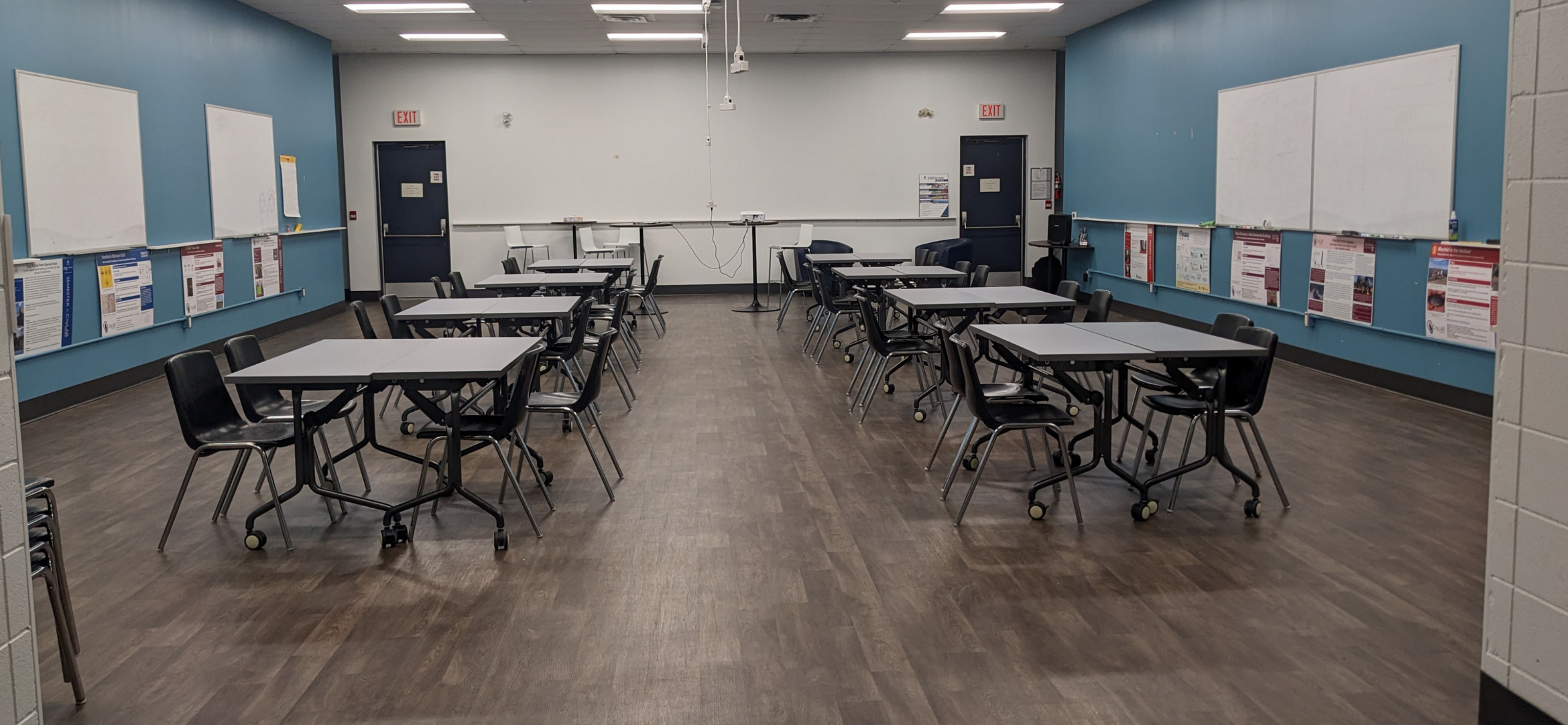
Classroom (Seats 40) - 7 whiteboards and a projector Optional: Speaker with Mic